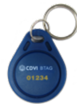
TAGM MIFARE® Classic Tag

All the information contained within this document (pictures, drawings, dimensions, specifications), could be perceptibly different and can be changed without prior notice. Published: 08 August 2023. CDVI_R125USB_R1356USB_DS_01_EN_LETTER_C