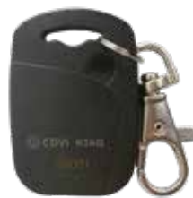
KTAG Black Key Ring Tag 125 kHz