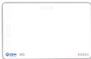
ISO25 Printable ISO Card